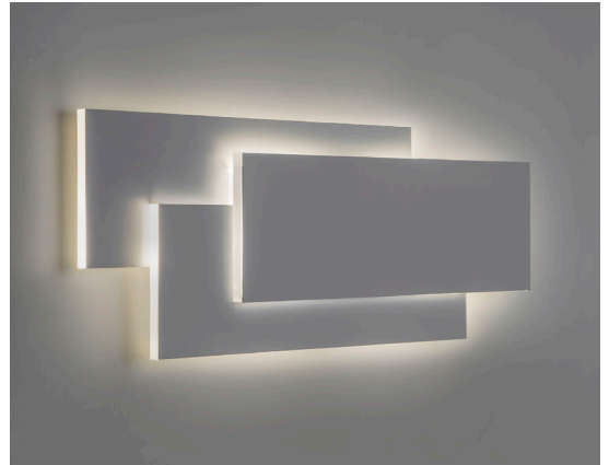
CODE: 1352006 FINISH: MATT WHITE

TO MAINTAIN THIS PRODUCT TO ITS BEST CONDITION, PLEASE VIEW OUR CARE AND CLEANING GUIDE ON THE SUPPORT SECTION OF THE ASTRO WEBSITE.