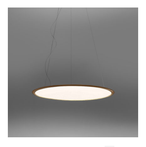
IP20 🖶 🔻 🕻 E Dimmerable: +0-