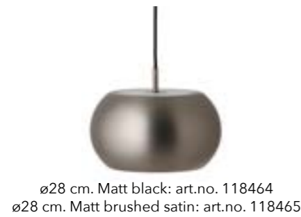
ø28 cm. Matt black: art.no. 118464 ø28 cm. Matt brushed satin: art.no. 118465