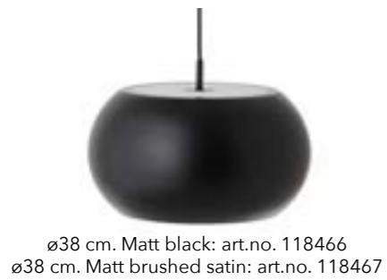
ø38 cm. Matt black: art.no. 118466 ø38 cm. Matt brushed satin: art.no. 118467