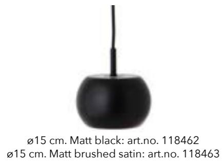
ø15 cm. Matt black: art.no. 118462 ø15 cm. Matt brushed satin: art.no. 118463