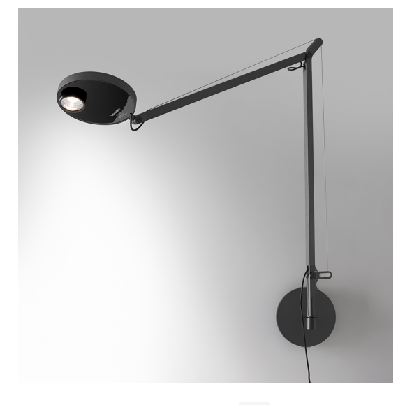
IP20 🗰 🔣 🤇 🕻 🕻 Dimmbar: +O-