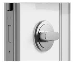
You have a thumbturn