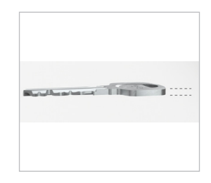
03 The thickness of your key is more than 6mm