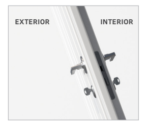
O2 You can't use a key on the inside and outside at the same time