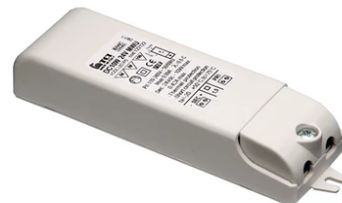
Power supply 24V 10W /110-240V IP20 Class II selv. Non Dimmable RF25747