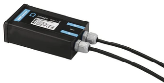
Power supply 24Vdc 20W / 220- 240V IP67 Class II selv. Non Dimmable RF25752