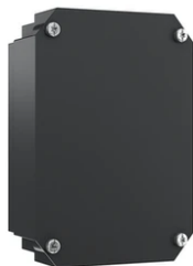
Box for installation for masonry or concrete wall F5962000