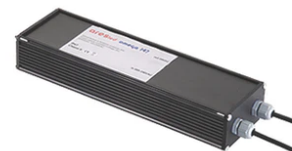
Power supply 24Vdc 50W / 120-240V IP67 Class II selv. Non Dimmable RF25755