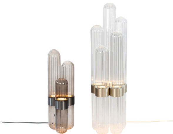
TABLE AND FLOOR LIGHT