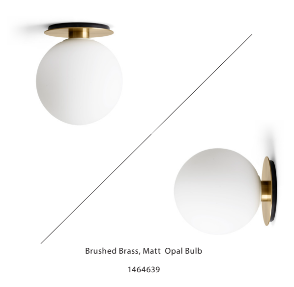
Brushed Brass w. DtW, Matt Opal Bulb 1464689