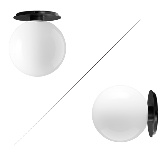
Black, Shiny Opal Bulb 1494629