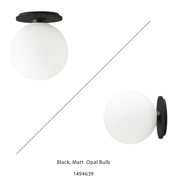
Black w. DtW, Matt Opal Bulb 1494689