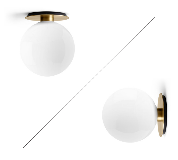
Brushed Brass, Shiny Opal Bulb 1464629