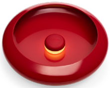
Coated metal shade