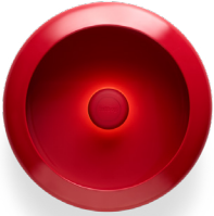
On the wall