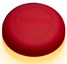
Rechargeable magnetic light