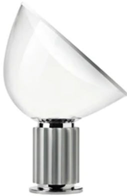
Table lamp providing indirect and reflected light. Reflector in painted aluminium, gloss white on the outside and matt white on the inside. Directionable diffuser in transparent PMMA. Body in matt black or naturally anodized extruded aluminium. Base in nickel-plated metal. Electric cable of useful length 220 cm, with dimmer switch for ON/OFF and adjustment of the light flow between 10-100%. Plug-in power supply with interchangeable plugs.

by Achille & Pier Giacomo Castiglioni , 1962