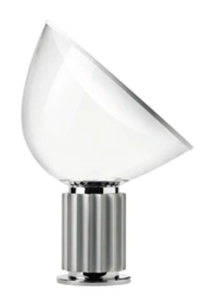
Table lamp providing indirect and reflected light. Reflector in painted aluminium, gloss white on the outside and matt white on the inside. Directionable diffuser in transparent PMMA. Body in matt black or naturally anodized extruded aluminium. Base in nickel-plated metal. Electric cable of useful length 220 cm, with dimmer switch for ON/OFF and adjustment of the light flow between 10-100%. Plug-in power supply with interchangeable plugs.

by Achille & Pier Giacomo Castiglioni , 1962