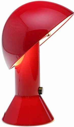
Table lamp indirect light. Adjustable reflector with inside screen made of aluminium painted in white. Molded resin structure in the new golden color. Also available in the series-production colors: white, black, orange, green, yellow, blue. Ruby red for it's 40 anniversary years. The lamp consist of a section of cone base and an adjustable diffuser dome-shaped.

Designed by Elio Martinelli in 1976, Elmetto even though in the design rigour, focuses on the functionality of the use with a large switch in the central body, easy to find in the dark and an adjustable reflector simple to move by the touch of a finger and it allows to shield the light source. A reliable friend, a companion of the evening.