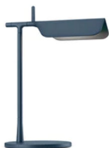
Table and floor lamps providing direct lighting with adjustable head. Body in painted pressofused aluminium. Multi-led diffuser in specially designed PMMA to avoid the Multi Shadow effect and dazzle. Head rotation from \pm 90^\circ .