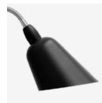
→ Black & Steel