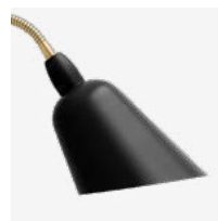
→ Black & Brass