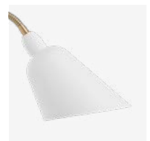
→ White & Brass