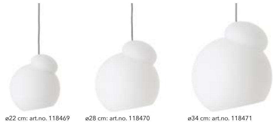
ø22 cm: art.no. 118469