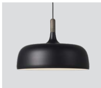
Acorn pendant white matt – Item no. 543