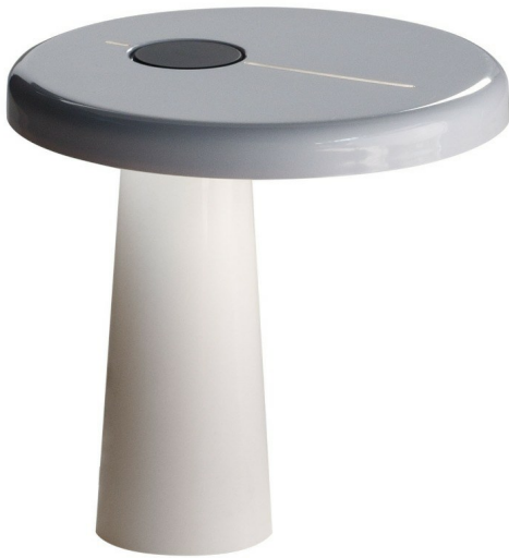
Table lamp with direct / diffused light. Moulded structure in white or black color. White opal methacrylate diffuser. LED light source integrated. Electronic driver on the plug. Touch ON-OFF button on the reflector.