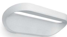
Sestessa maxi led