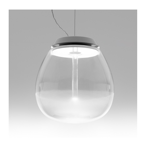
IP20 ⊕ Œ [fil (€ Dimmerable: +0-