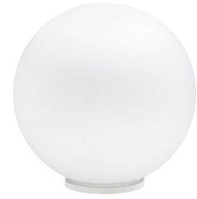
Table lamp with diffuser in satin-finish white blown glass. Supporting structure made of metal or polyester reinforced with glass fibre, painted white.