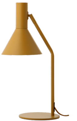
Matt almond: art.no. 101397