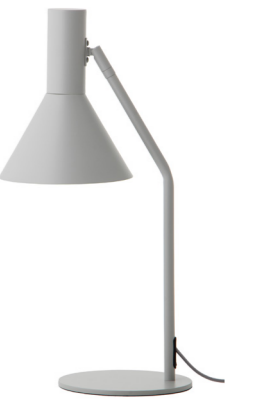
Matt light grey: art.no. 101399