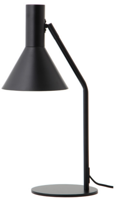
Matt black: art.no. 101401