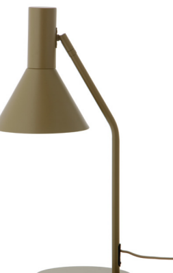
Matt green: art.no. 123040