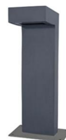
396 Nero / Black