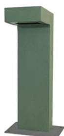
393 Verde / Green