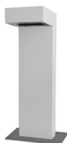
392 Bianco / White

Colori dei materiali / Colors of the materials