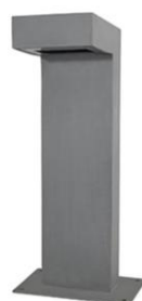
395 Grigio / Grey