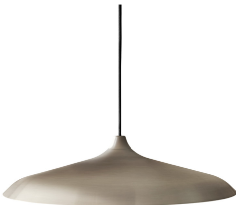
Bronzed Brass 1680869