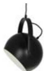
Matt black ø19 cm: art.no. 100319