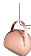
Glossy copper ø19 cm: Art.no. 100316