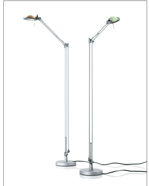
D12 EL t.