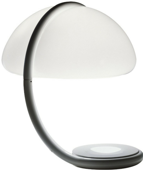
Table lamp with diffused light, swilling upper arm. White opal methacrylate diffuser. Arm and base are in white or golden lacquered metal.

Designed in 1965 by Elio Martinelli, the lamp is made by acrylic techniques innovative for the time in which it was designed and revives the atmosphere of those years, decisive for the success of Italian design in the world.