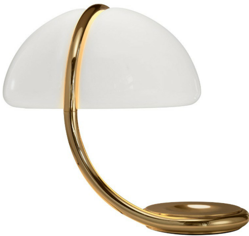
Table lamp diffused light, swivelling upper arm and white opal methacrylate diffuser. The upper arm and the basement of the lamp in the golden version is signed and numereted 100+1 pieces on the occasion of the 50th anniversary of its production.