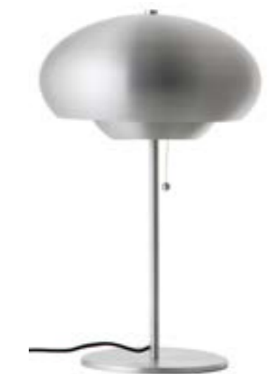
Matt brushed aluminium: art.no. 101326 Black fabric cord