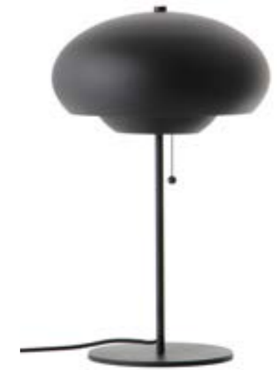
Matt black: art.no. 101324 Black fabric cord