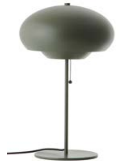
Matt green: art.no. 101323 Green fabric cord