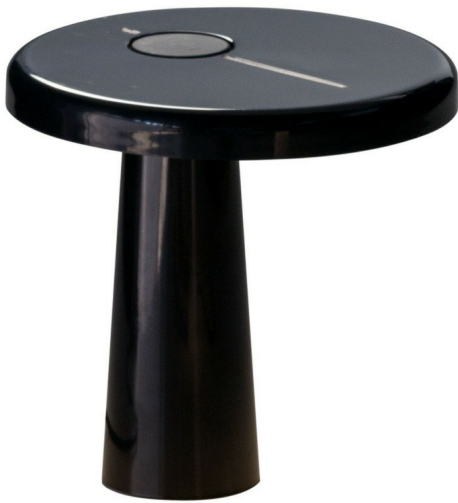
Table lamp with direct / diffused light. Moulded structure in white or black color. White opal methacrylate diffuser. LED light source integrated. Electronic driver on the plug. Touch ON-OFF button on the reflector.