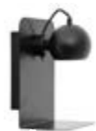
Matt black. Art.no. 104530