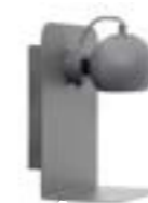
Matt grey. Art.no. 104528