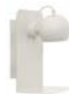
Matt white. Art.no. 104534