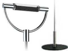
satin chrome black base cod 1501 weight 5,0 kg