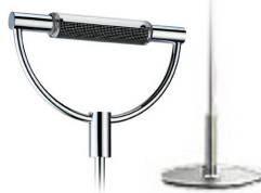
satin chrome satin chrome base cod 1504 weight 6,1 kg