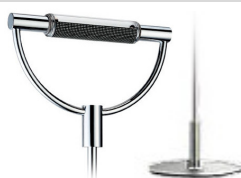
shiny chrome shiny chrome base cod 504 weight 6,1 ka