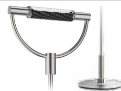
satin nickel-plated nickel-plated satined base cod 591 peso 6,1 kg