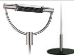
satin nickel-plated black base cod 503 weight 5,0 kg