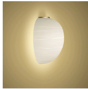
Rituals XL Mix&Match