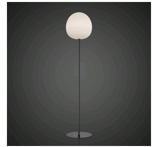
Rituals XL Mix&Match