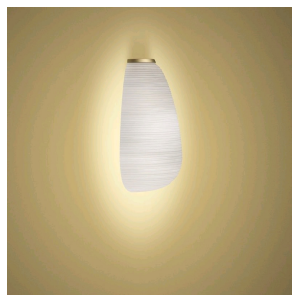
Rituals 1 Mix&Match