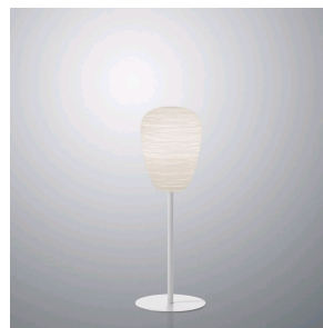
Rituals 1 Mix&Match