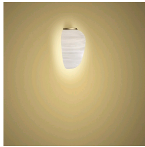
Rituals 3 Parete