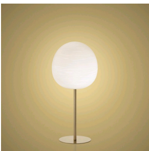
Rituals XL Mix&Match