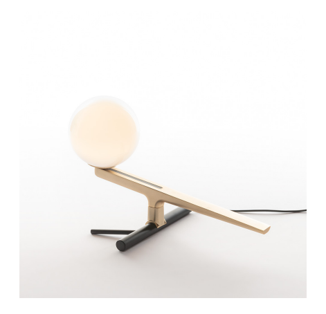
IP20 ŵ ∰ (€