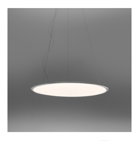
IP20 🖶 🔻 🕻 E Dimmerable: +0-