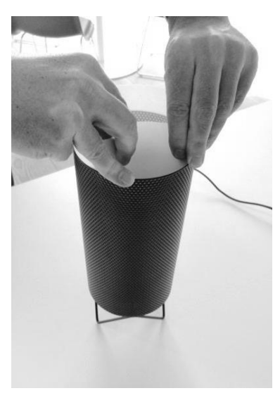
1. Make a fold on the inner shade and lift it out of the lamp.