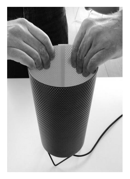
6. Make sure the inner shade is held firmly against the metal and that it fits well

5. The new inner shade is now ready to be inserted in the lamp with the adhesive tape pointing inward.