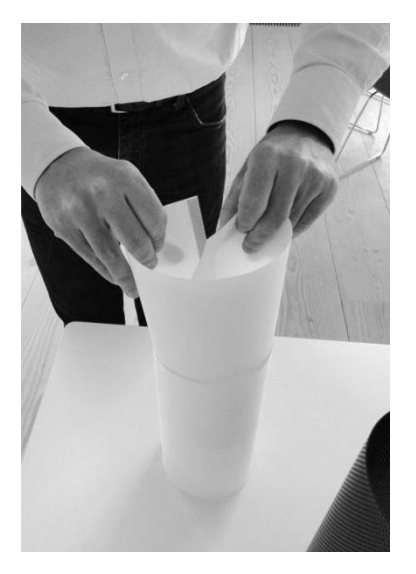
2. Fold the new inner shade with the adhesive tape pointing inward.