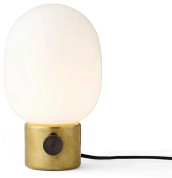
Mirror Polished Brass 1800839