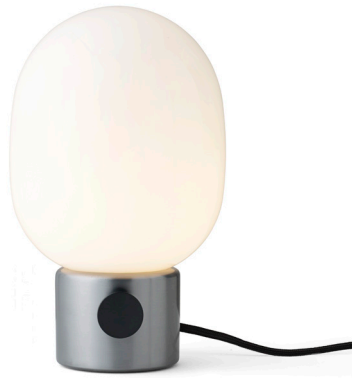
Brushed Steel 1800039