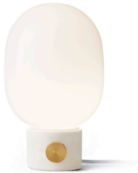
Light Grey/Brass 1800129