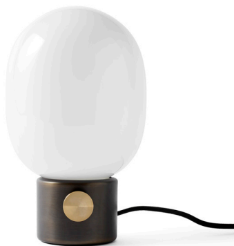
Bronzed Brass 1800859