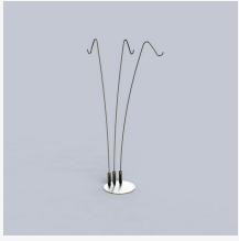
Base with supports - Ciulifruli