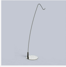
Base with support - Ciulifruli