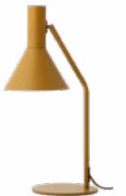
Matt almond: art.no. 101397