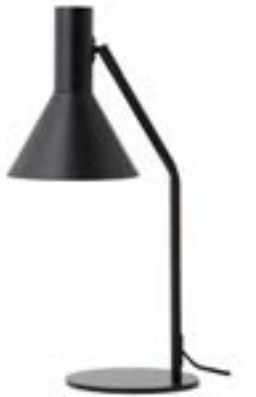
Matt black: art.no. 101401