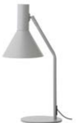
Matt light grey: art.no. 101399