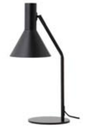
Matt black: art.no. 101401