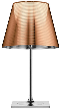
Table luminaire providing diffused lighting. Base, rod support and diffuser support in diecast, polished and chrome-plated Zamak alloy. Base cover in black injection-molded PA (Nylon). Injection-molded PC (polycarbonate) opal inner diffuser. Outer diffusers in transparent or fumée PMMA (polymethylmethacrylate), and silver or bronze on the inner surface, by vacuum aluminum coating. Injection-molded PC (polycarbonate) upper ring, completely transparent or transparent diffuser and silver diffuser) or transparent brown for the outer bronze diffuser.