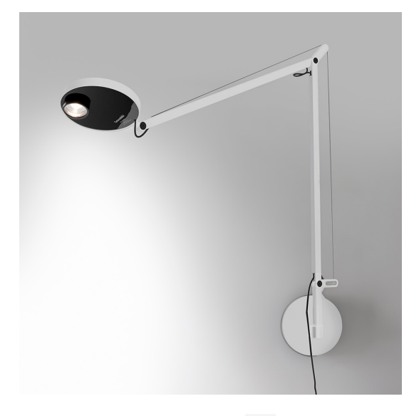
IP20 🗰 🔣 🤇 🤆 Dimmbar: +O-