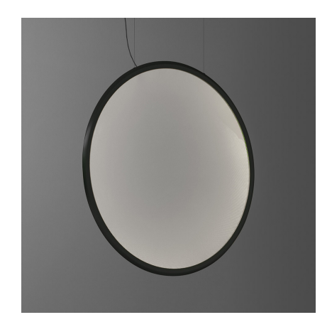
IP20 🖶 🎕 🕻 Dimmerable: +0-