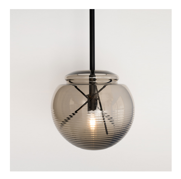
IP 20 ( II )