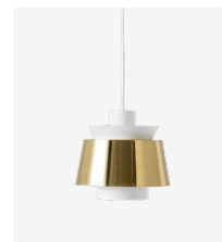
→ Brass & White