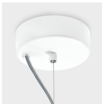
Ceiling rose detail