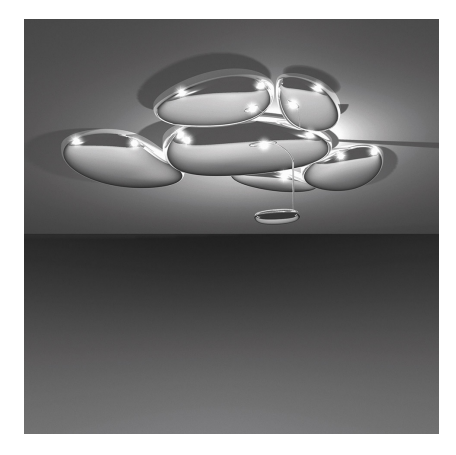
IP20 (≟) 《 ■ Dimmerable: + 0 -