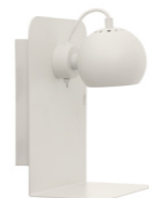
Matt white. Art.no. 104534