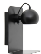
Matt black. Art.no. 104530