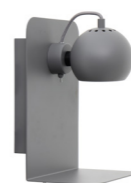
Matt grey. Art.no. 104528