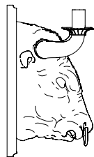
SE258 NR INT