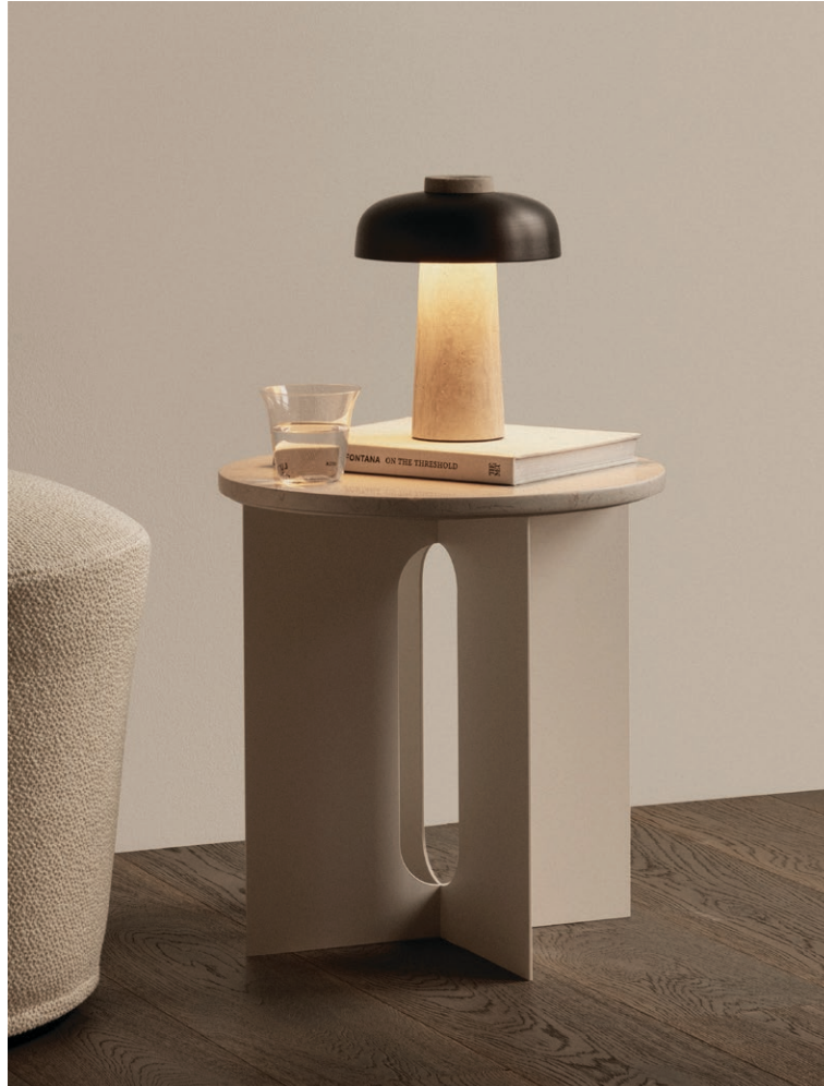
REVERSE TABLE LAMP, PORTABLE Designed by Aleksandar Lazic