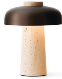
BRONZED BRASS 71231-007329

This rechargeable lamp can also be used with the Audo Charging Board. However, due to the size of the lampshade, not all ports on the board can be occupied simultaneously.