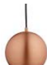
Matt brushed copper. Art.no. 100182 Black fabric cord