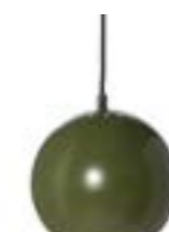
Matt Dark green. Art.no. 100204 Black fabric cord