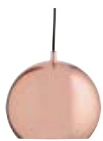
Glossy copper. Art.no. 100175 Black fabric cord