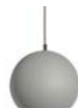
Matt light grey. Art.no. 100208 Grey fabric cord