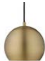
Matt antique brass. Art.no. 100167 Black fabric cord