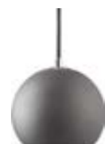
Matt dark grey. Art.no. 100205 Black fabric cord