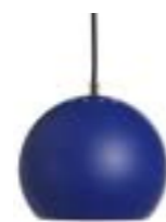
Matt cobalt blue. Art.no. 100207 Black fabric cord