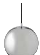
Glossy chrome. Art.no. 100188 Black fabric cord