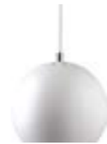
Matt white. Art.no. 100201 White fabric cord