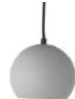
Light grey structure. Art.no. 100214 Black fabric cord