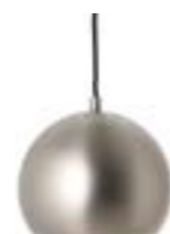
Brushed Satin. Art.no. 100186 Black fabric cord