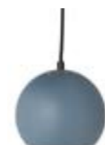
Matt dust blue structure. Art.no. 100212 Black fabric cord