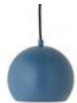
Matt petrol blue. Art.no. 100164 Black fabric cord