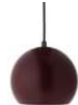
Matt dark bordeaux. Art.no. 100209 Black fabric cord