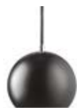
Matt black. Art.no. 100199 Black fabric cord